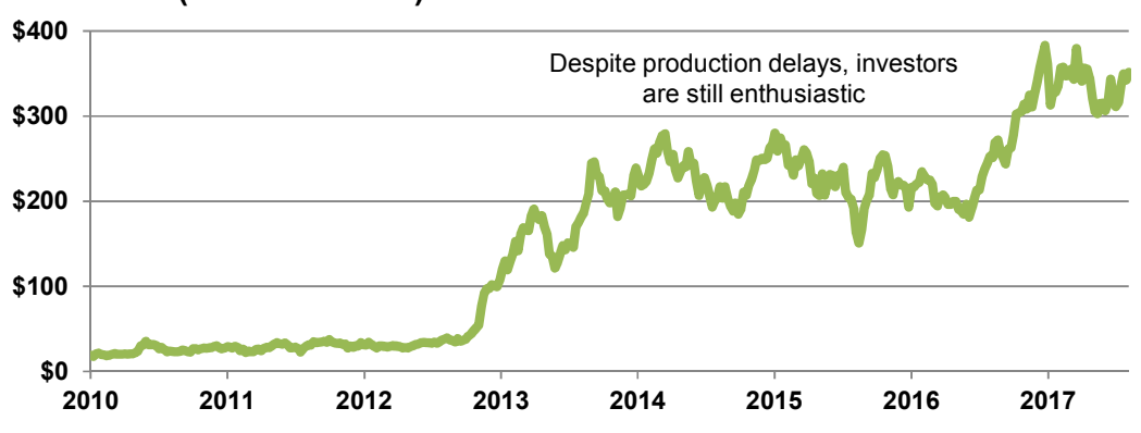
Chart 1: Tesla Inc. (in U.S. dollars)