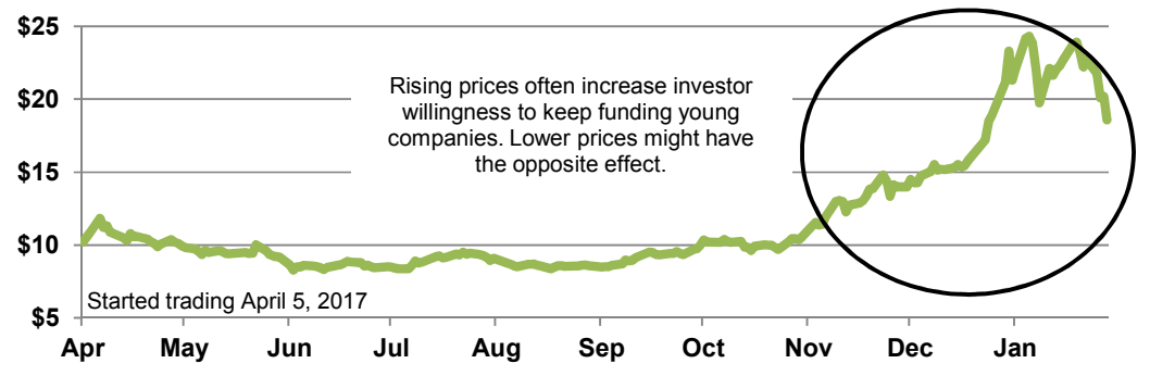
Chart 2: Horizons Marijuana Life Sciences Index ETF (in Canadian dollars)

Source: Bloomberg Finance L.P. as of 2/1/2018